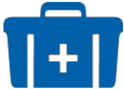
Prepare A Kit

Many people are concerned about the possibility of a public health emergency such as a natural disaster, act of terrorism, or disease outbreak. You can take steps now to help you prepare for an emergency and cope if an emergency happens. To help you prepare, we’ve provided step-by-step actions you can take beforehand to protect yourself and your loved ones.